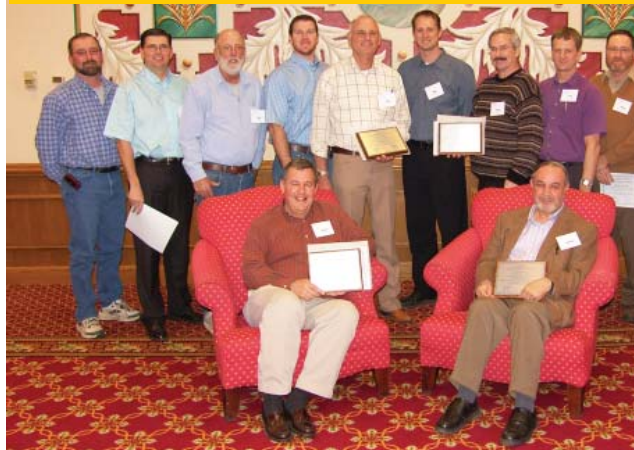
STPN-TMT-61-2(111), N-61 over UP RR at Lake McConaughy