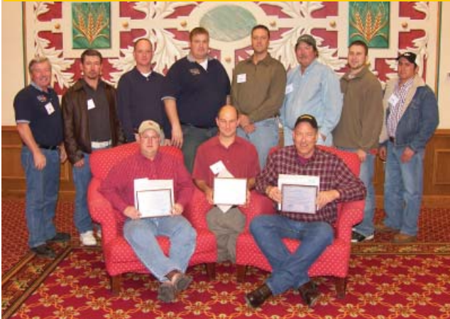
EACNH-80-9(861), I-80 from US 77 Easterly to I-80