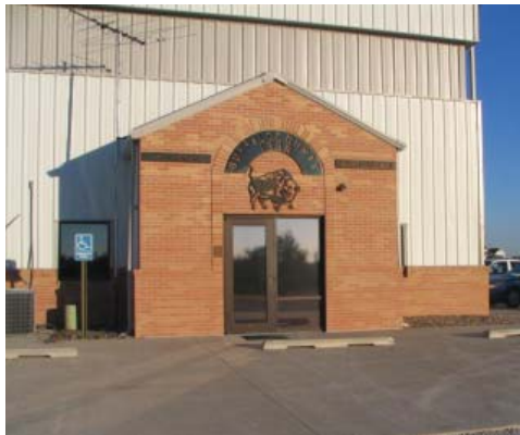
Buffalo County Highway Department Building

achieve longer life before needing a major repair caused the Board to choose the concrete option. And the concrete pavement will cost less to maintain to boot!