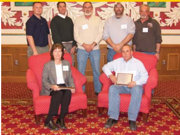
Tecumseh Municipal Airport