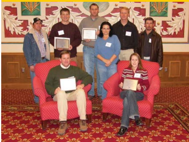
Pioneers Boulevard Widening From Antelope Crk to Pagoda Ln