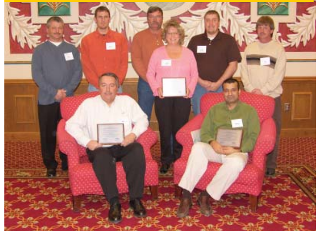
RD-77-2(1049), US 77 from I-80 Northerly 7.0 Miles