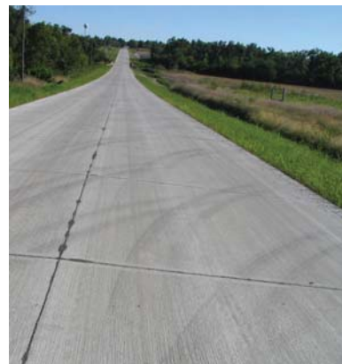
Looking South into Riverdale

Even though the asphalt was $5,704 cheaper, the fact the concrete will