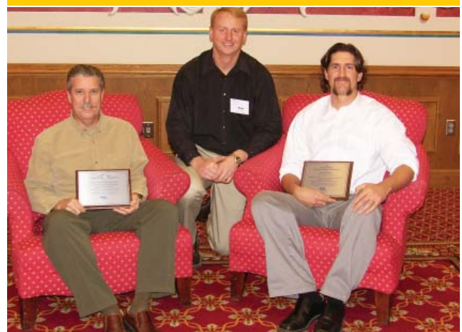
Antelope Creek Trail, Phase 2