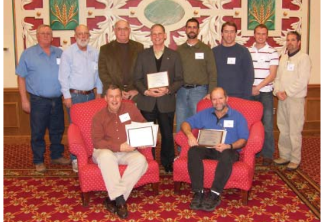
STPD-STPM-14-2(118), Highway 14 in Aurora