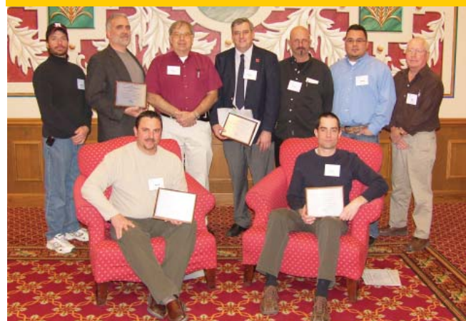
UNL Nebraska Tractor Test Laboratory